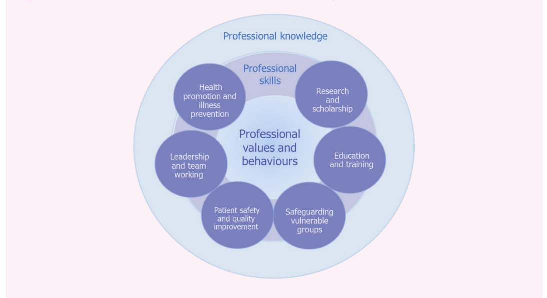
Figure 2: The nine domains of Generic Professional Capabilities 6

The domains and subsections of the GPC framework are directly identifiable in the clinical radiology curriculum. They are mapped to each of the generic and specialty CiPs, which are in turn mapped to the assessment blueprints. This is to emphasize that they must be demonstrated at every stage of training as part of the holistic development of responsible professionals.