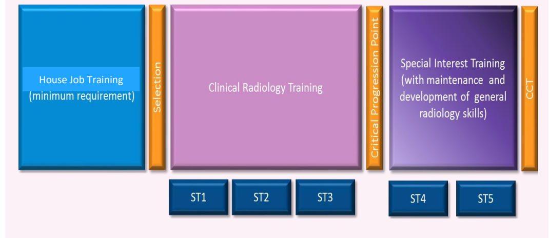
Figure 1: Training pathway for clinical radiology

At ST5, there will be a greater focus on specialist skills, with a guideline of 40% of trainee's time spent on maintaining general radiology skills and 60% spent on developing their area of special interest. The training pathway diagram in Figure 1 illustrates this structure.